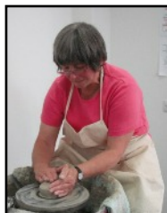
Happy potters and crafty knitters (who also indulge in cakes during the meeting)